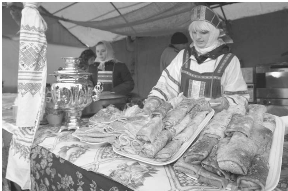
A Bliny (pancakes) vendor in traditional Ukrainian costume at Maslenitsa, an ancient week long celebration of the end of winter and the beginning of the Lenten season in the Eastern Orthodox churches.